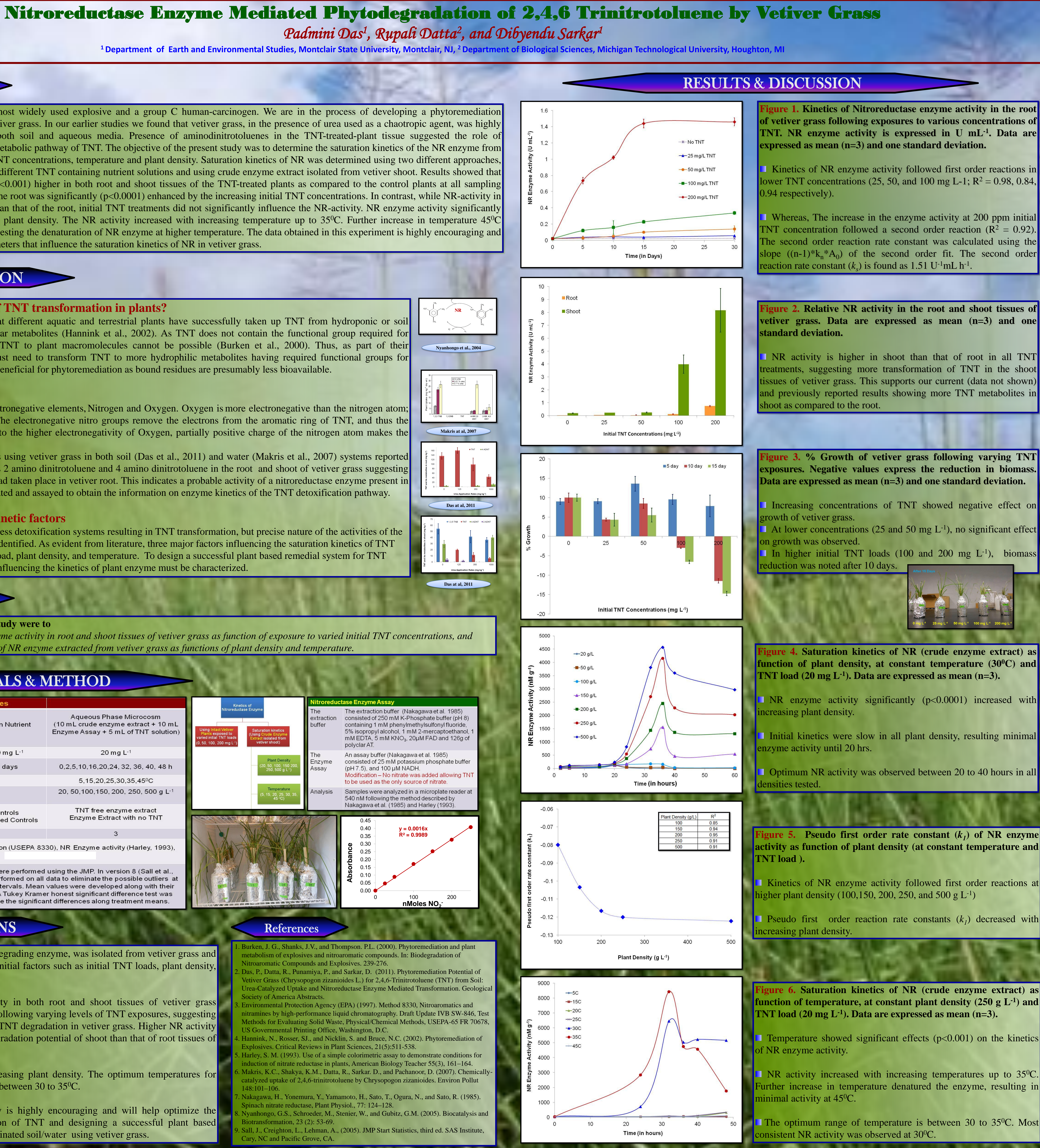
Figure 1. Kinetics of Nitroreductase enzyme activity in the root of vetiver grass following exposures to various concentrations of TNT. NR enzyme activity is expressed in U mL<sup>-1</sup>. Data are expressed as mean (n=3) and one standard deviation.

8. Nyanhongo, G.S., Schroeder, M., Stenier, W., and Gubitz, G.M. (2005). Biocatalysis and Biotransformation, 23 (2): 53-69. 9. Sall, J., Creighton, L., Lehman, A., (2005). JMP Start Statistics, third ed. SAS Institute, Cary, NC and Pacific Grove, CA.