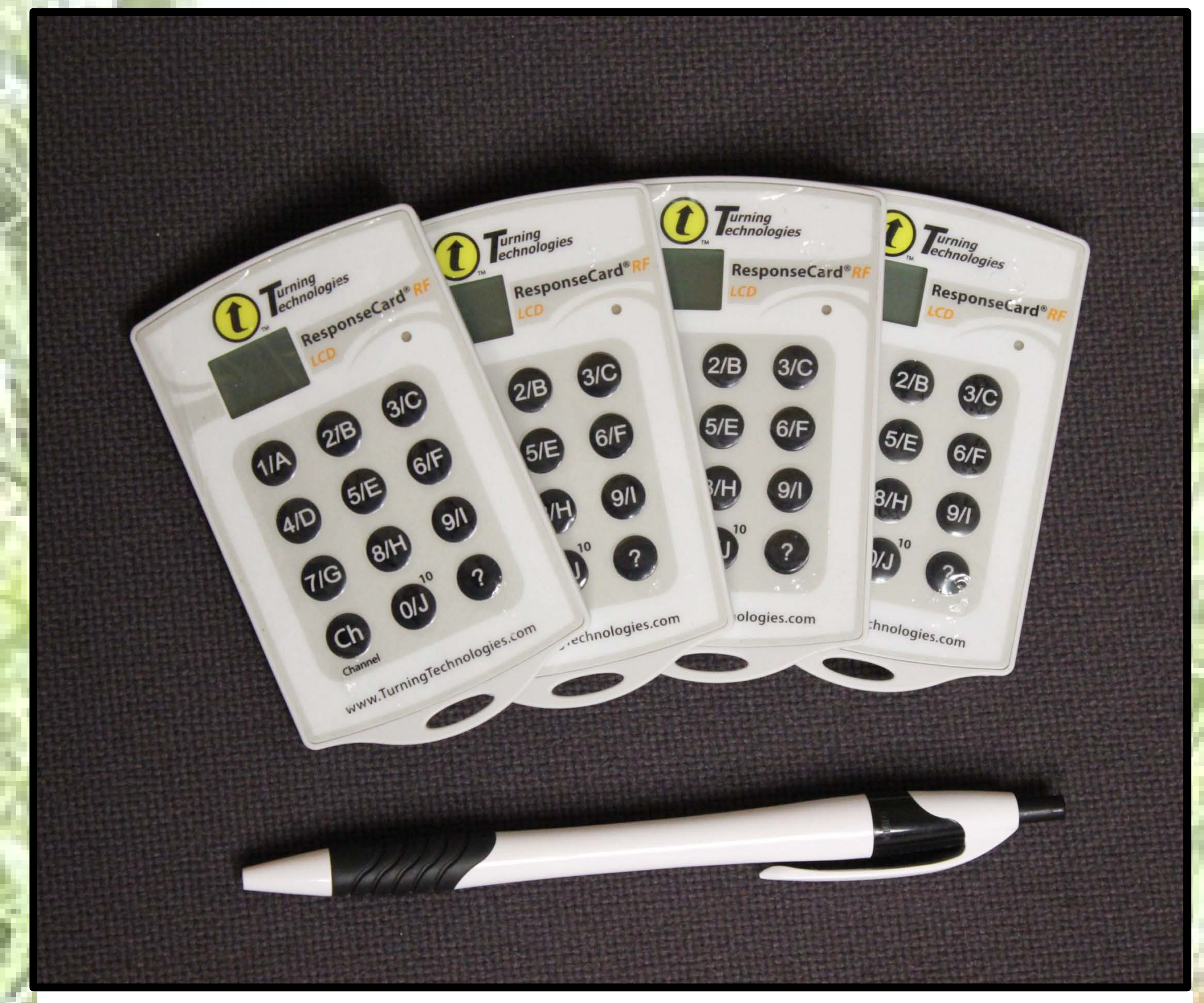
Figure 1. Student response clickers used in data collection.