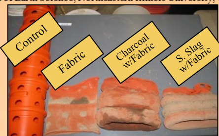
Rainfall Simulations: Soil Box and Tile Data Collection