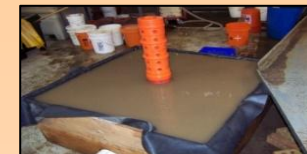
Greater ponding with the fabric