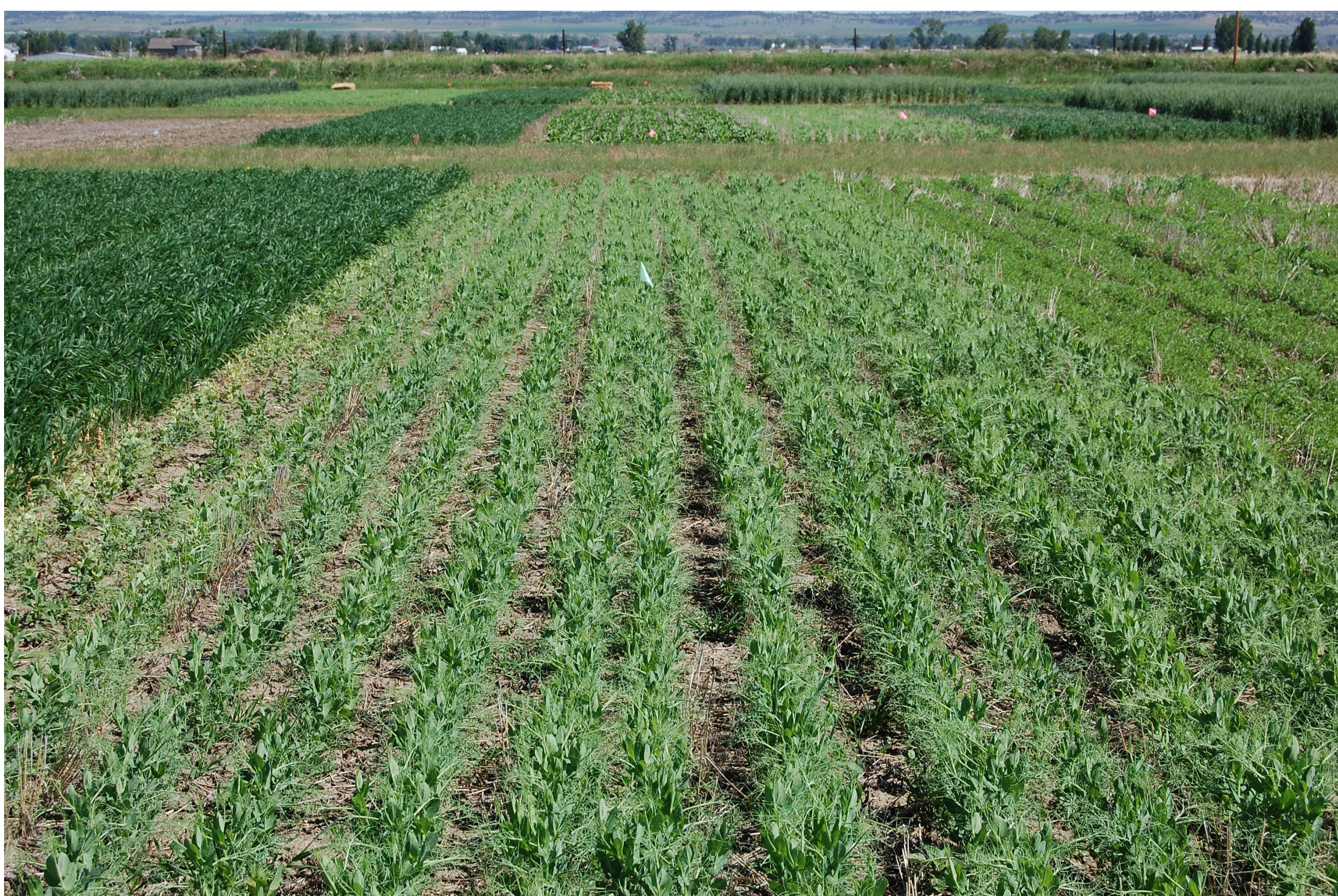
Figure 1. Spring peas following winter wheat, June 2014.