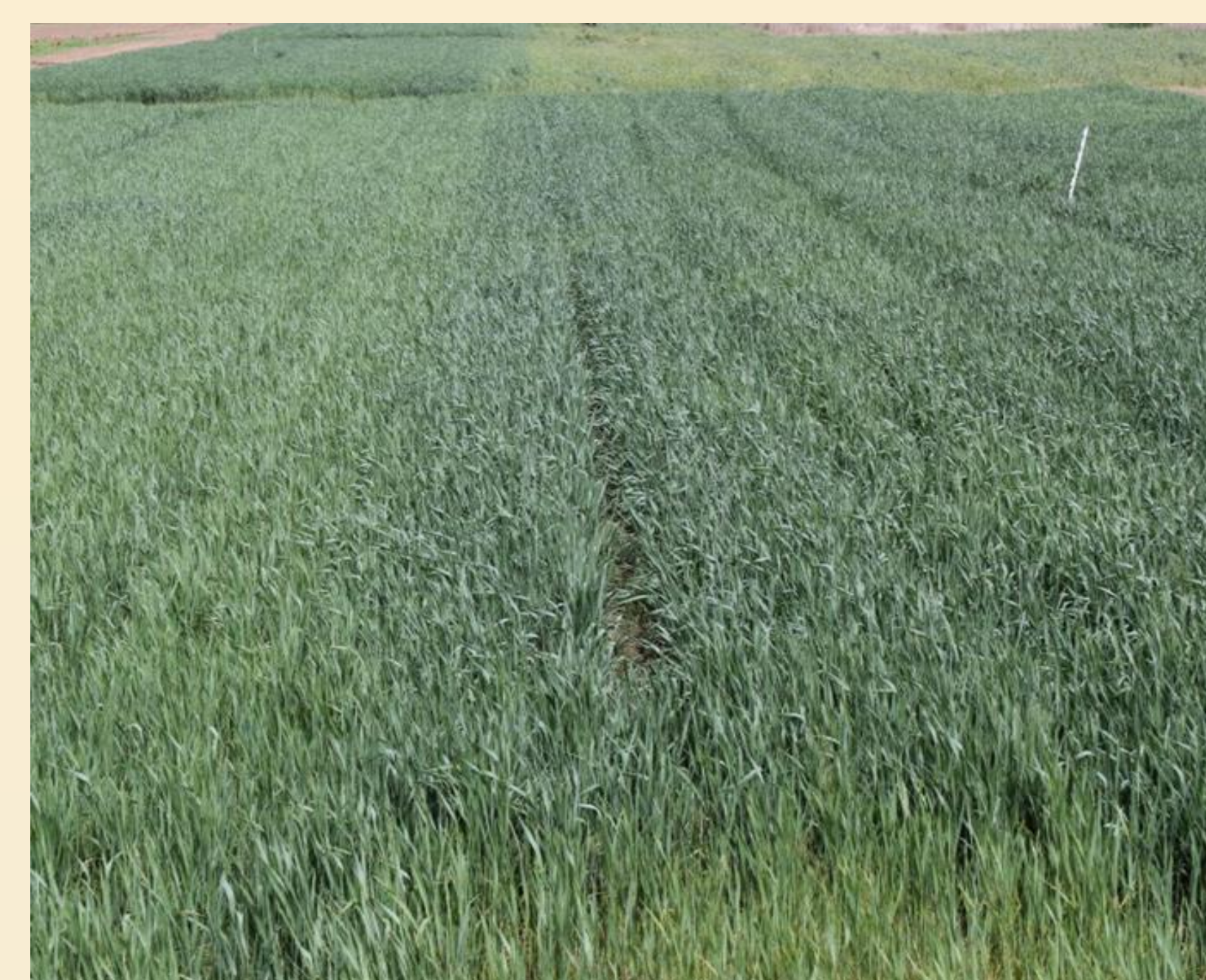
Fig. 3. Wheat showing differences in leaf pigment color between treatments.