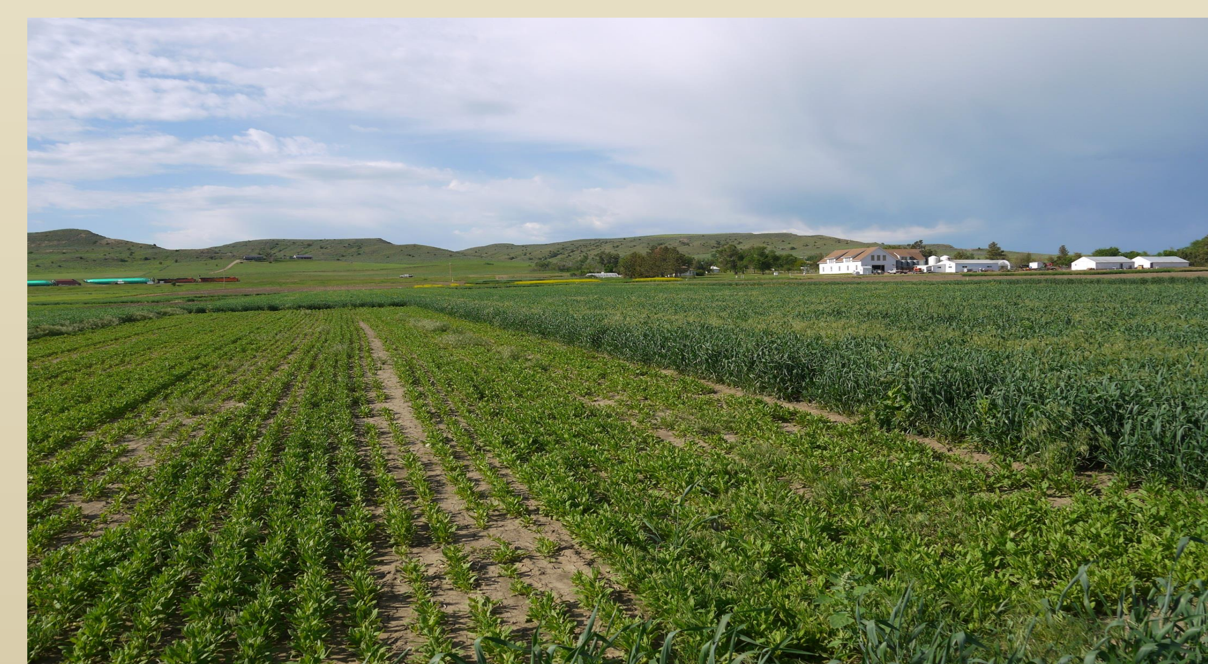
Fig. 1. Field plots at Wyarno, near Sheridan, WY showing both camelina and wheat in rotation.

Economics: Camelina diesel production cost, feed meal cost, and expected selling price were determined according to Foulke et al. (2013). The selling price of wheat grain was determined according to the USDA-ERS 2013 estimates. The fallow period was managed by a one-time herbicide application and tillage in the spring and was estimated at $34.7 ha -1 .