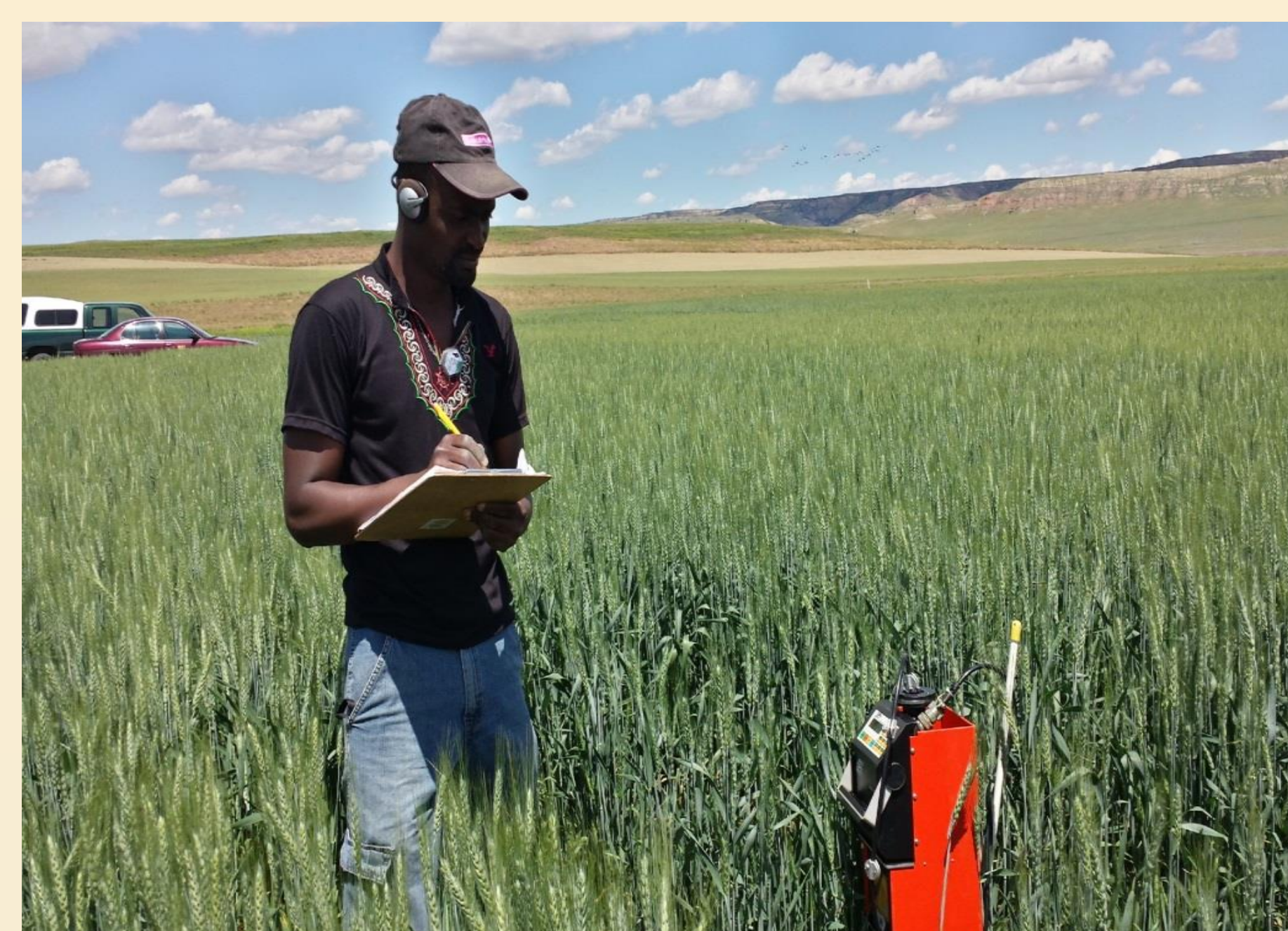
Fig. 2. Soil moisture measurement using a neutron probe.