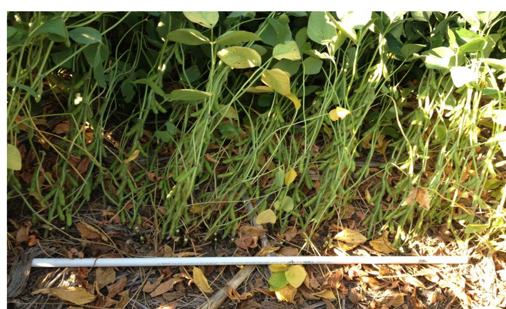
Picture 2: Collection of whole-plant biomass for total P uptake at full seed (R6)