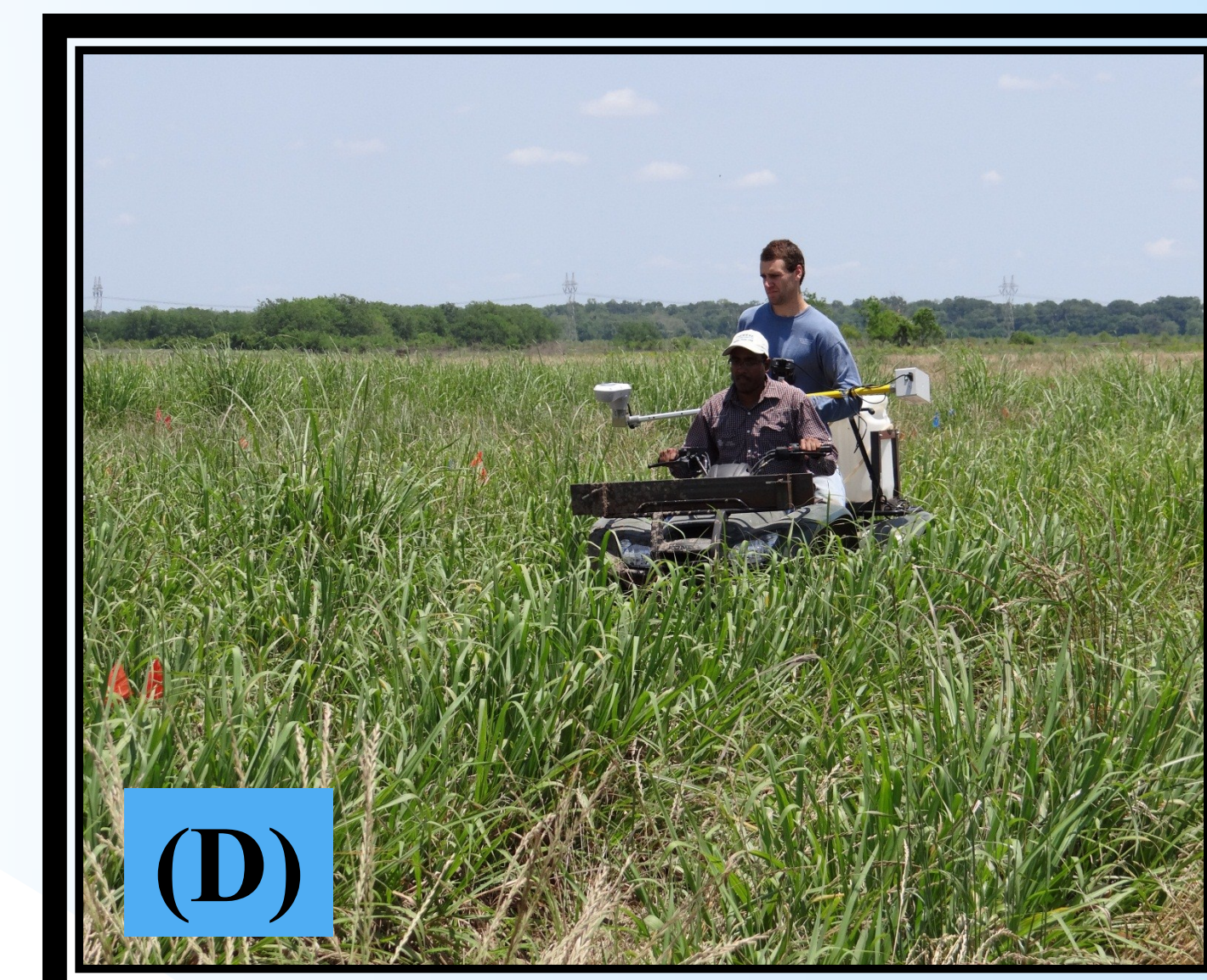
Pictures (A-D): (A) Mechanical planting of energy cane billets; (B) Knifing-in of liquid N fertilizer (as urea ammonium nitrate); (C) Collection of canopy reflectance reading using GreenSeeker® handheld sensor two months after emergence and (D) at maximum tillering stage