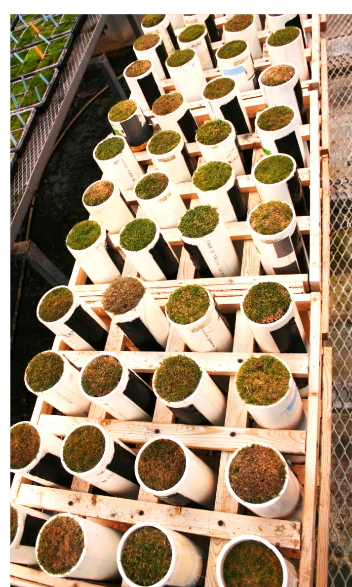
Figure 1. Turfgrass at 14 days after drought treatment.