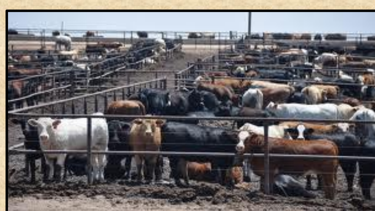
Fig. 1. Study feedyard in Deaf Smith Co., TX.