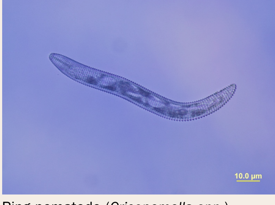
Ring nematode (Criconemella spp.)