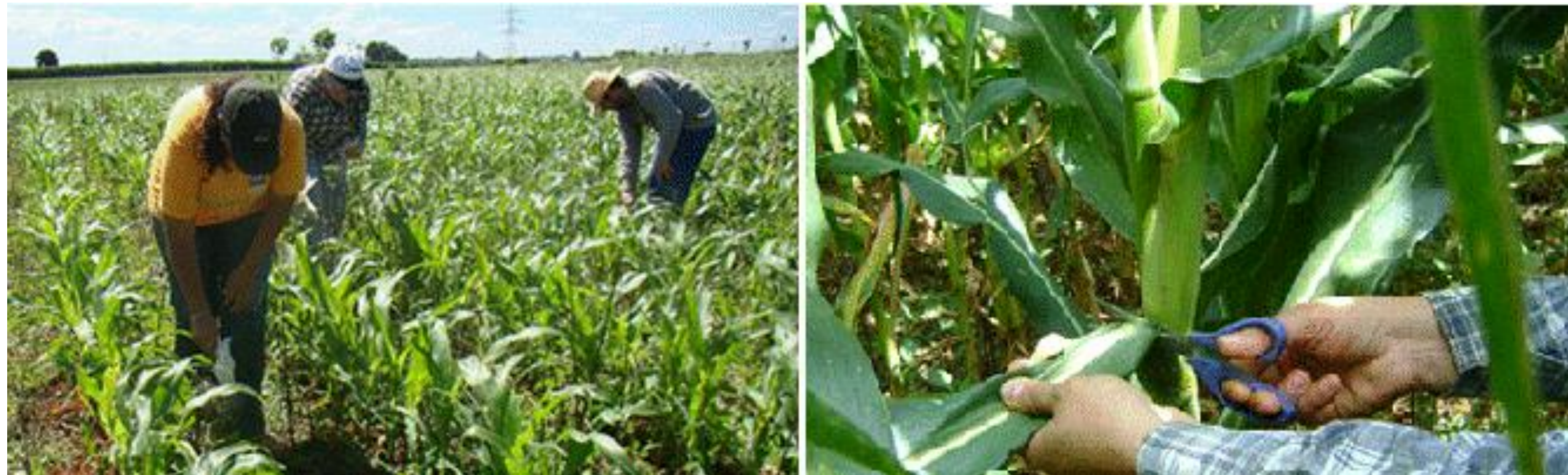
Figure 1. Fertilizers application and leaf sampled Experiment:

➤ Brazil → urea is the most used source of N in agriculture;