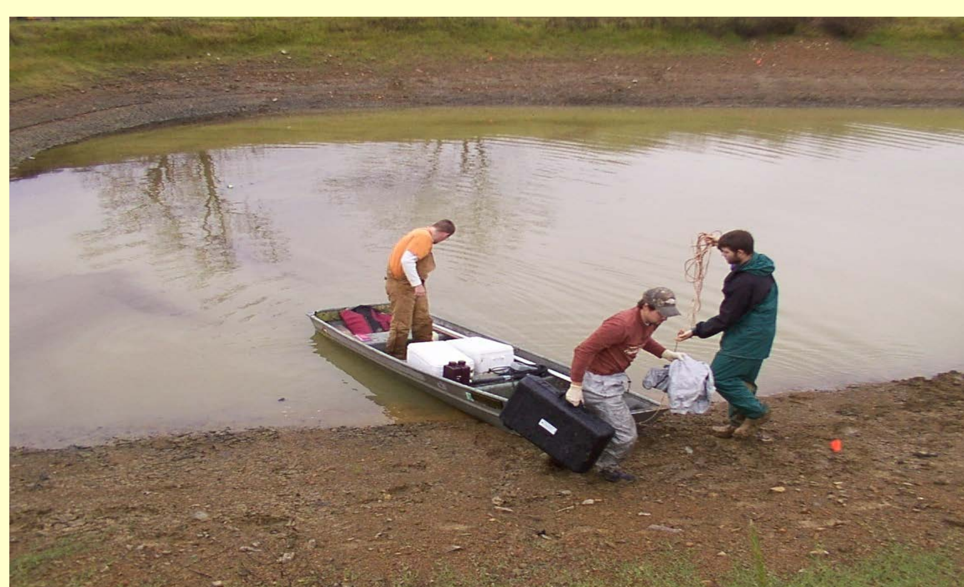
Fig 1. Drilling fluid was collected in settling ponds.

Hydraulic fracturing or fracking is a recently developed process for extracting natural gas from shale deposits. The process involves the high-pressure injection of water, sand, bentonite, barite, NaOH, and other chemicals into geologic formations to increase the release of natural gas deposits (Arthur et al., 2008; Miller et al., 1980). Each natural gas well uses approximately 4x10 6 L of water in the fracking process (Airhart, 2011). When the fracking process is completed, the resulting fluid and shale cuttings are returned to the surface and transported to holding ponds where the solids settle (Fig. 1). The solids are referred to as drilling mud and the liquid phase is known as hydraulic-fracturing drilling fluid. In the past, it was possible to obtain a permit to surface apply the drilling fluid to land.