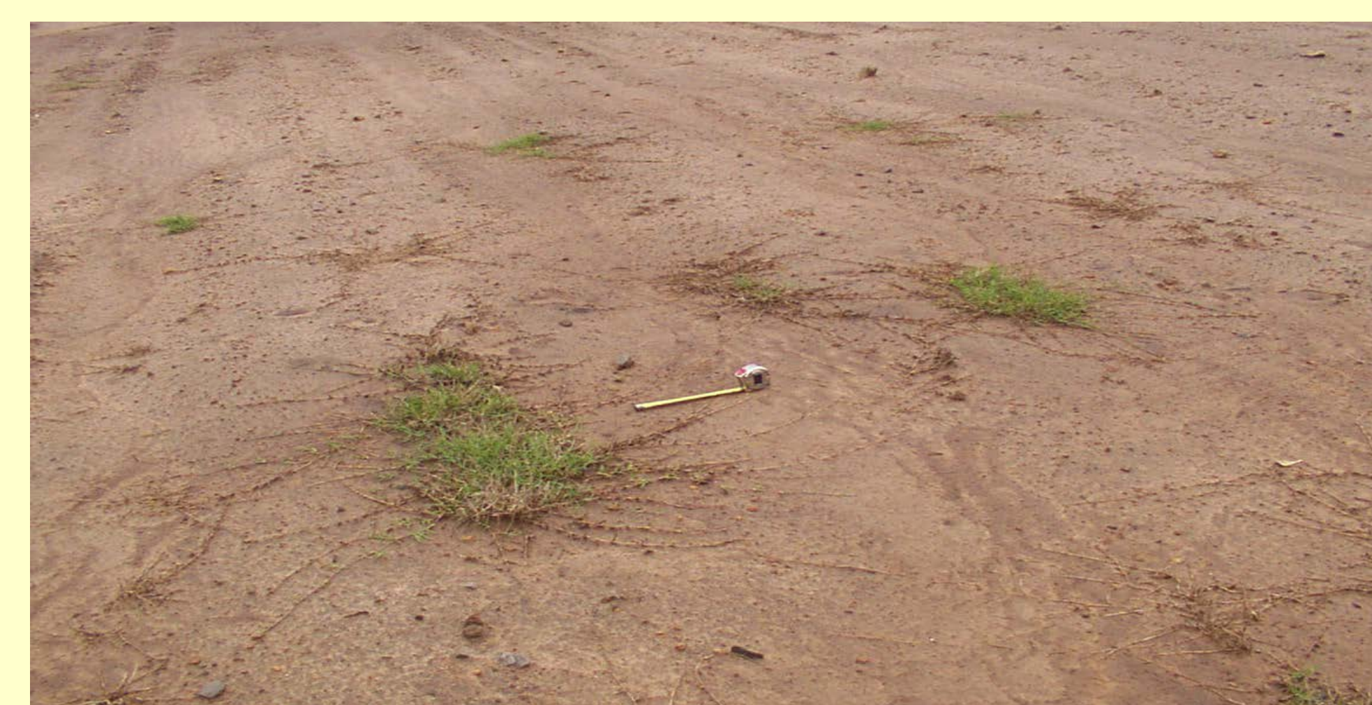
Fig 2. Excess application of drilling fluid can increase soil salinity and restrict plant growth.

In Arkansas, the Department of Environmental Quality (ADEQ) regulated the land application process of water-based drilling fluids based upon the physical landscape (slope, storage capacity, and weather), physical and chemical soil properties (electrical conductivity, soil salinity, and pH), and the drilling waste characteristics (ADEQ, 2009). Excess application of drilling fluid results in increased soil salinity, which inhibits seed germination, survival, and plant growth. (Brady and Weil, 2002; Zvomuya et al., 2009). At some sites, over application of drilling fluid resulted in contaminated soil that could not be vegetated to meet ADEQ requirements (Fig 2).