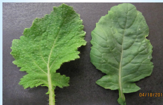
Fig 3: Morphology of leaf hairiness (left) and non-hairiness (right).