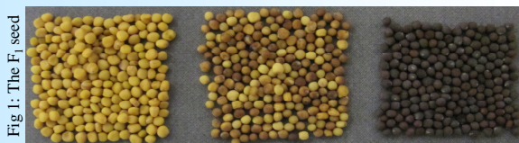
Fig 1: The F 1 seed